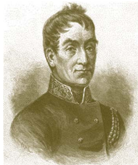
Governor Lachlan Macquarie (1762-1824)